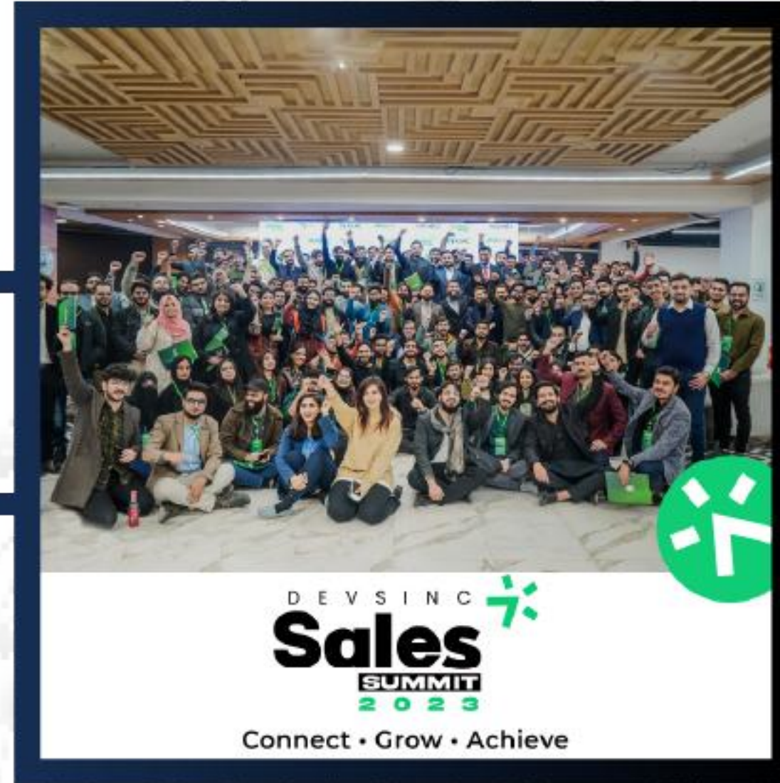
SALES SUMMIT 2023