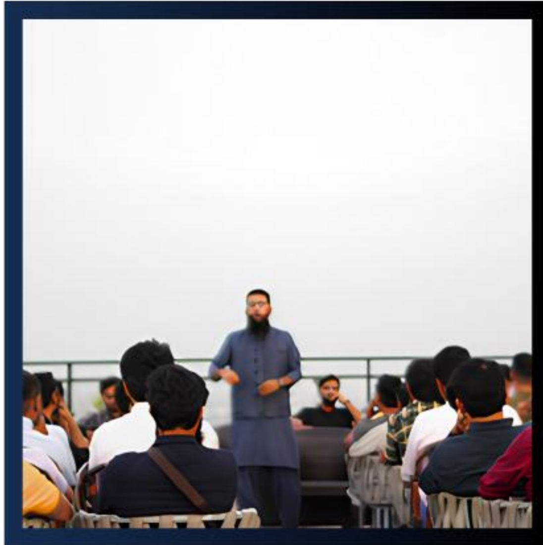
FOUNDERS CLUB 2021- PRESENT