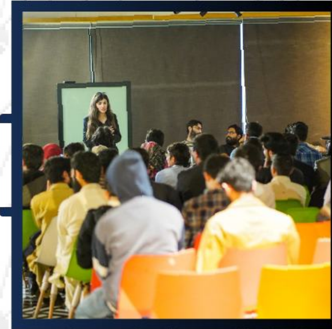
TECH EMPOWERMENT PROGRAM 2023- PRESENT